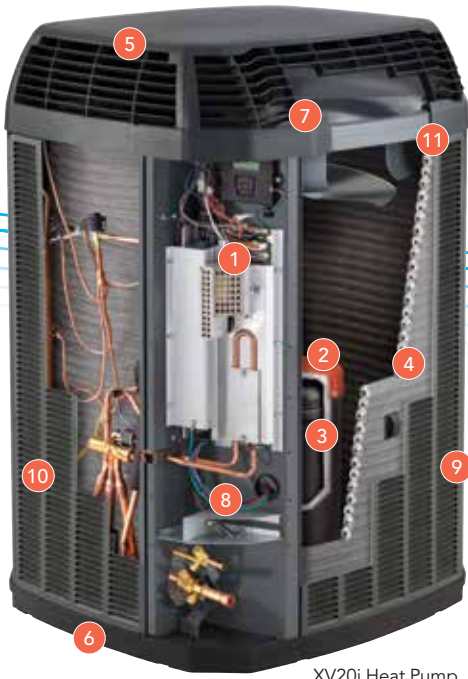
XV20i Heat Pump