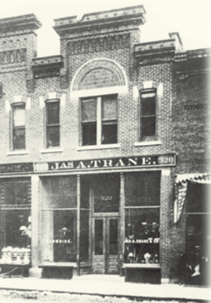
Trane Storefront La Crosse, Wisconsin 1891

Trane has a tradition of quality lasting more than a century.