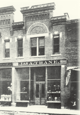
Trane Storefront La Crosse, Wisconsin 1891